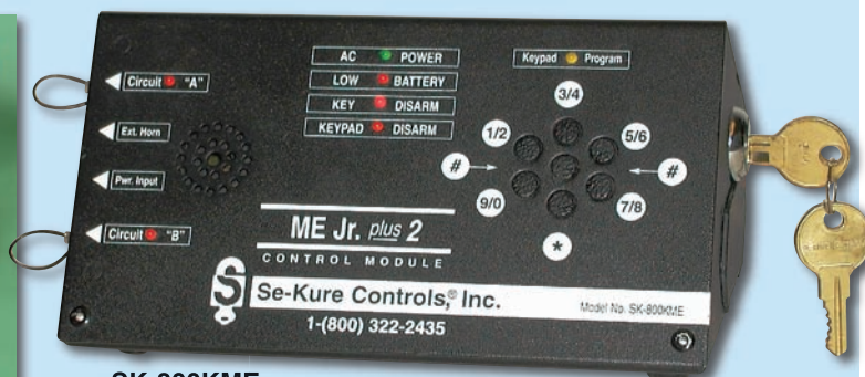
SK-800KME “ME®” Jr Plus 2 Keypad Alarm Module