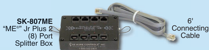
SK-807ME “ME®” Jr Plus 2 (8) Port Splitter Box