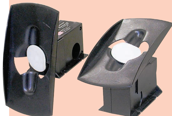
SK45-1300 Front Mount Recoiler Caddy

The Perfect Way to Display Remote Controls or Cellular Phones