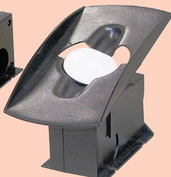
SK45-1300T Top Mount Recoiler Caddy