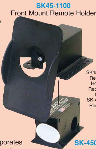
SK45-1100 Front Mount Remote Holder

SK45-1100 Remote Holder Requires the SK-4500G Recoiler