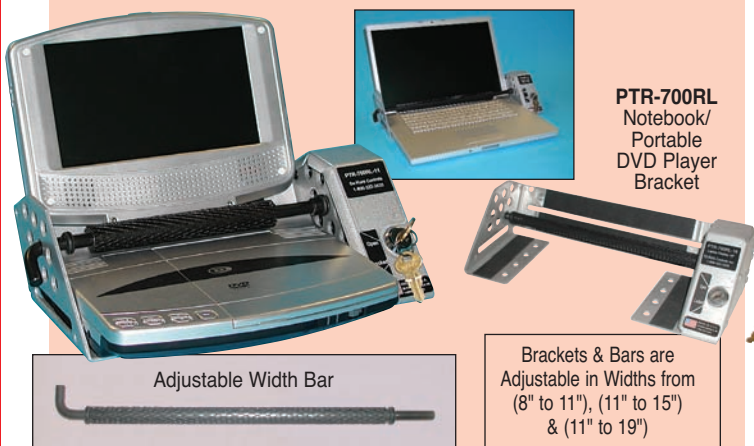
PTR-700RL Notebook/ Portable DVD Player Bracket