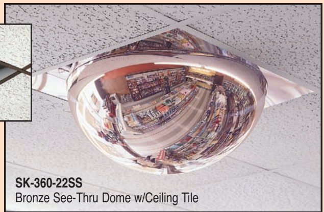
SK-360-22SS Bronze See-Thru Dome w/Ceiling Tile

Our See-Thru Panels and Domes are designed for CCTV camera usage or visual viewing. A variety of sizes and shapes are available. Different colors and custom cuts/shapes may be special-ordered to fit the décor of most retail stores.