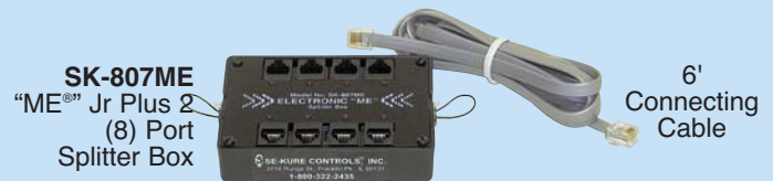
SK-807ME "ME®" Jr Plus 2 (8) Port Splitter Box 6' Connecting Cable