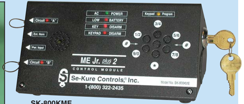
SK-800KME "ME®" Jr Plus 2 Keypad Alarm Module