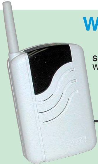
SK-22-310 Wireless Receiver