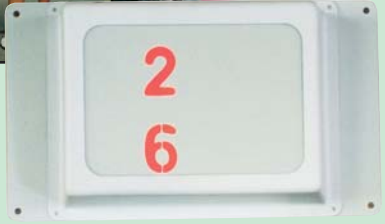
SK-22-616 Fitting Room Receiver