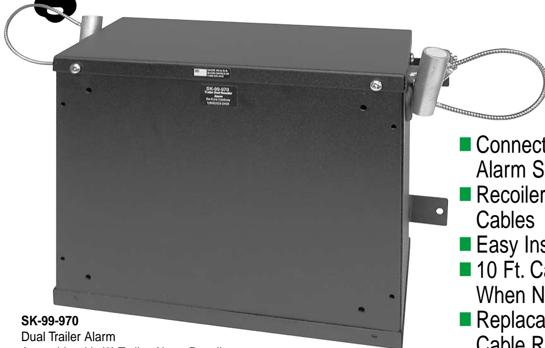
SK-99-970 Dual Trailer Alarm Assembly with (2) Trailer Alarm Recoilers

■ Each Unit Protects Up To 2 Storage or Overnight Trailers